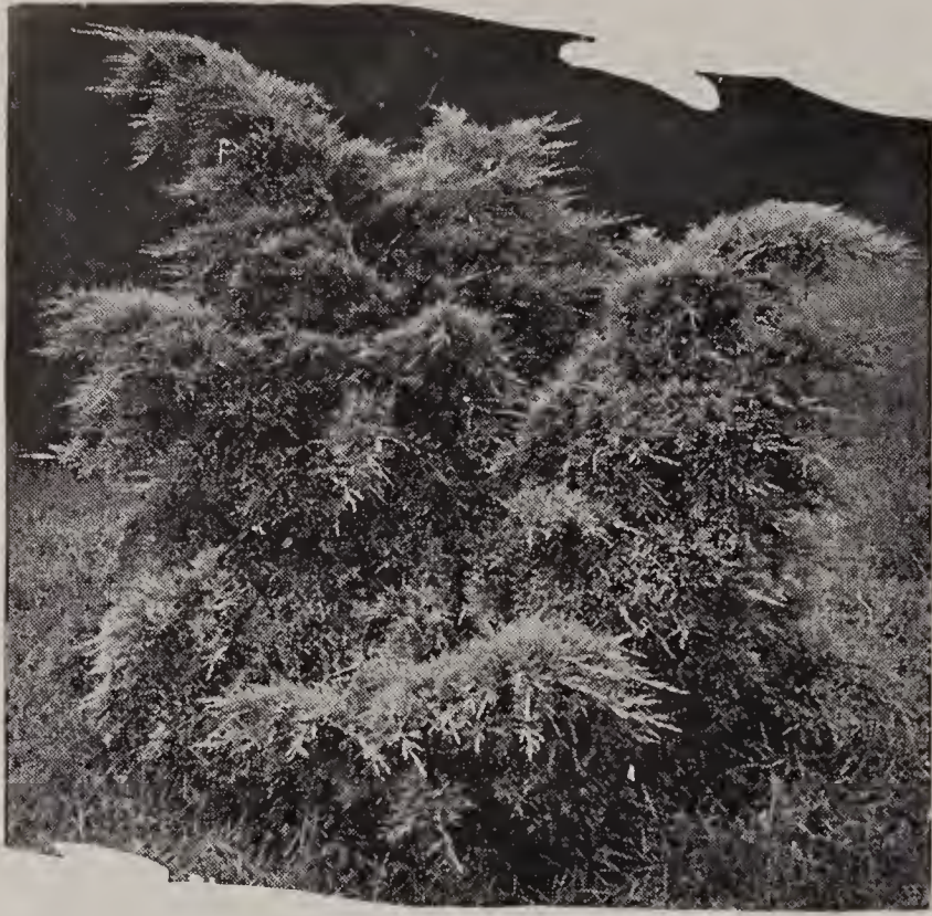
Juniperus chinensis pfitzeriana